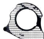
For 251Ts and 251TCs

Debris shield reduces the amount of palm fibres, pine needles and other small debris from getting inside the engine.