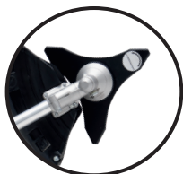
3 CUTTER METAL BLADE AS OPTION.